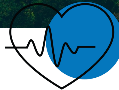
Workplace Health Care