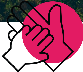
Workplace Flexibility & Leave